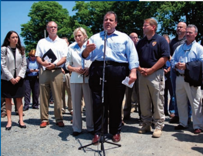
Governor Chris Christie and Lt. Governor Kim Guadagno hold a press conference after meeting with Office of Emergency Management on the water emergency situation in Oceanport, NJ on Saturday, June 30.